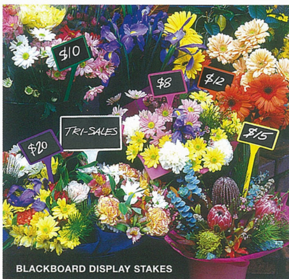
BLACKBOARD DISPLAY STAKES